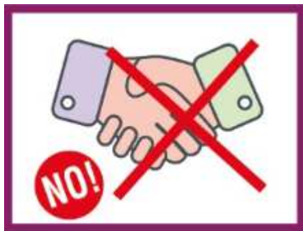
DO NOT SHAKE HANDS