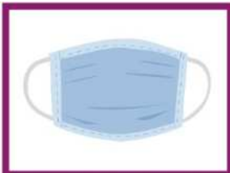
WEAR MASKS IN COMMON AREAS