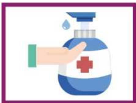
USE HAND SANITIZER GEL