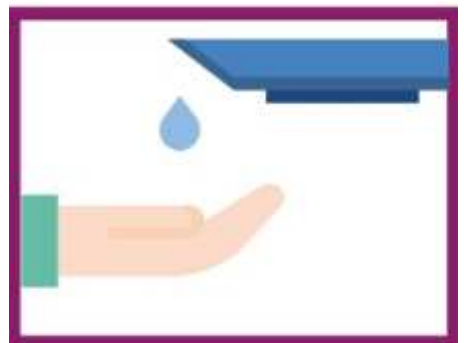
WASH YOUR HANDS REGULARLY